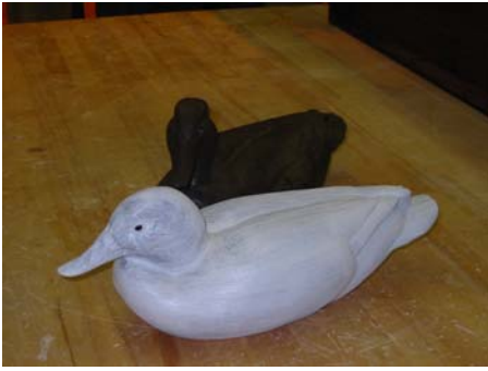
Tony Albano brought in some carved ducks made from sugar pine.

Floss Lazzibiltz (sorry Floss on the spelling) brought in some Basswood carvings and spoons One of the spoons was finished with walnut oil. Nice work Floss.